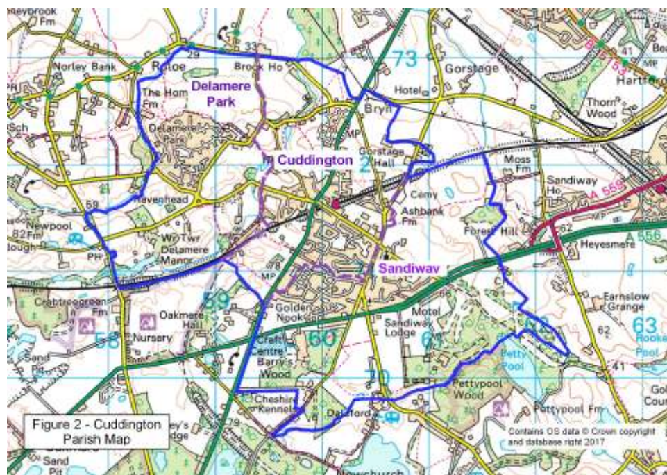
Fig 2: Detailed Map of Cuddington Parish