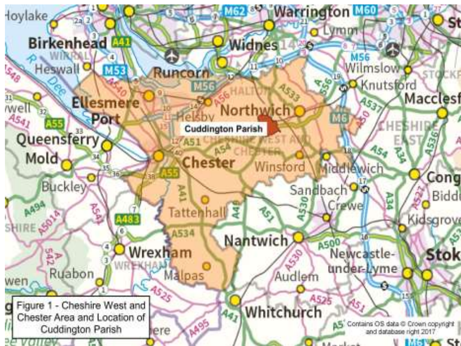
Fig 1: Location of Cuddington Parish in the Cheshire West and Chester Borough