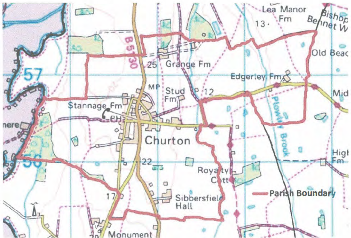
Churton Parish Boundary indicated with red line