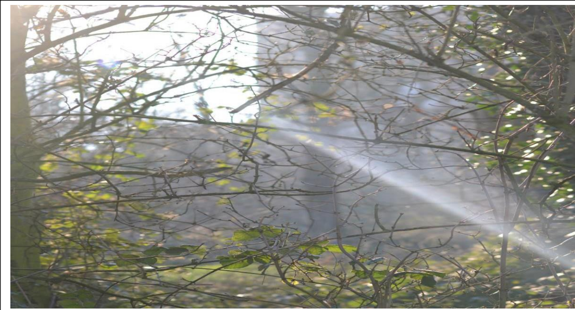
The path crosses the Kemira Road and runs alongside Quinn Glass(ENCIRC).