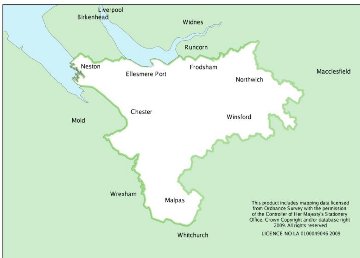
Map 2.1 Cheshire West and Chester Sub Region

2.3 The area contains key settlements of Chester City and Ellesmere Port to the west, Frodsham to the north and Northwich, Winsford and Tarporley to the east.