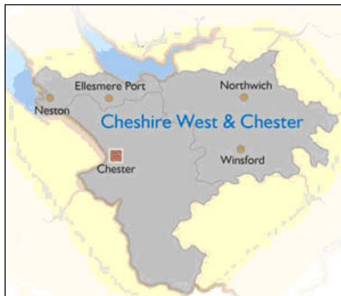
Figure 1-A: Cheshire West and Chester Council's Administrative Boundary and PFRA Study Area

The main urban areas (shown in Figure 1-A) include the historic city of Chester with a population of 59,000, the industrial towns of Ellesmere Port (63,000), Northwich (21,000), and Winsford (31,000), together with the smaller settlements of Neston, Frodsham, Helsby and Malpas. There are also a number of rural villages across the area,